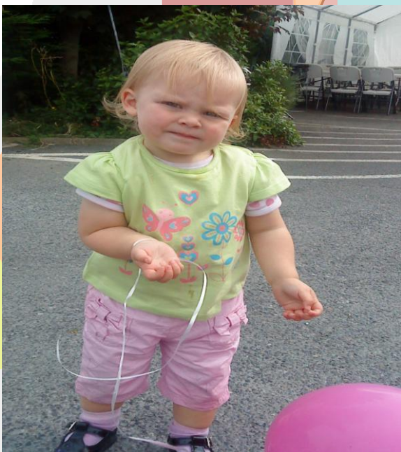
Little girl enjoying Family Fun Day in Knockanrawley

We are looking for children to enter their Christmas drawings for the cover of our 2009 Christmas Card. The winning picture will be used as the Christmas card sent out from the South Tipperary County Childcare Committee this year. (Please do not submit drawings with cotton wool attached). The date for receipt of last entries is Friday 9th November 2009. Will you please include the child's name, age and the name of your service with each entry. GOOD LUCK to all those budding young artists. A presentation will be made to the winning entry.